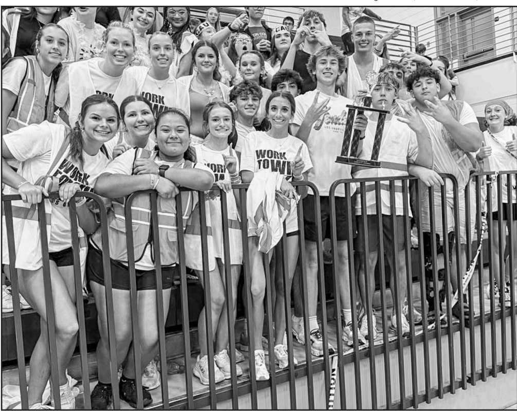
The sophomores (Class of 2027) won the Athletic championship at last week's Olympics.