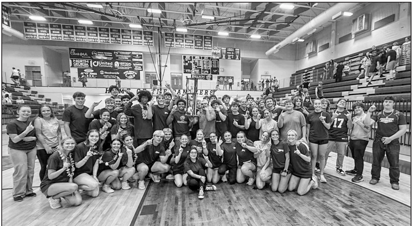
The juniors (Class of 2026) were crowned Academic champions and the overall Class of the Year at last Friday's Olympics.

A year ago, the Class of 2024 earned both the academic and athletic trophies, but the Class of 2026 was able to slip past them for the Class of the Year trophy.